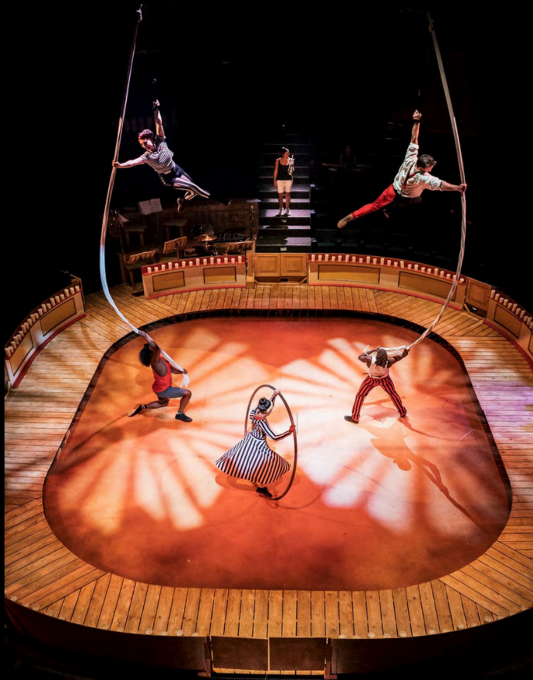
Astley’s Astounding Adventures (New Vic production)

The New Vic is a registered charity with a turnover of £5 million and operates thanks to a unique partnership between Arts Council England, Newcastle-under-Lyme Borough Council and Staffordshire County Council.