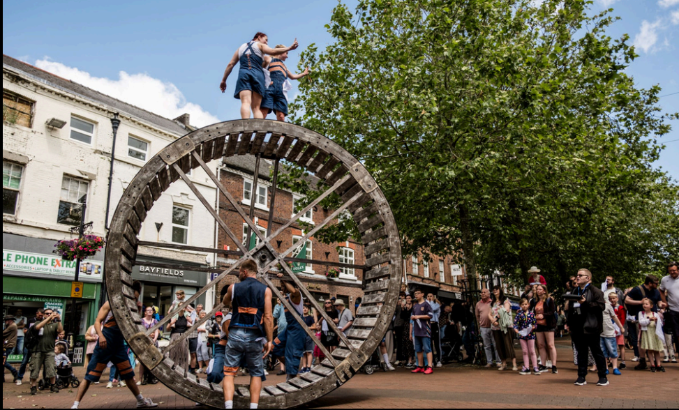
Parade - The Giant Wheel by Autin Dance (2024)