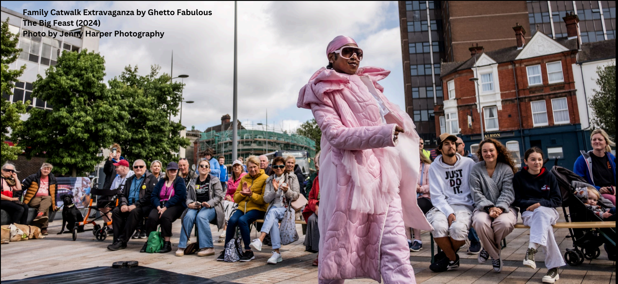
Family Catwalk Extravaganza by Ghetto Fabulous The Big Feast (2024)