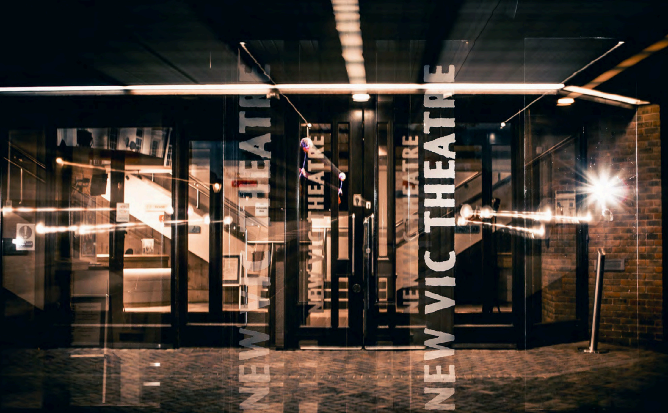
New Vic Theatre , Etruria Road, Newcastle-under-Lyme, Staffordshire, ST5 0JG. Stoke-on-Trent & North Staffordshire Theatre Trust Ltd. Company registration number: 911924. Charity registration number: 253242. The New Vic Theatre operates thanks to partnership between Arts Council England, Newcastle-Under-Lyme Borough Council and Staffordshire County Council.