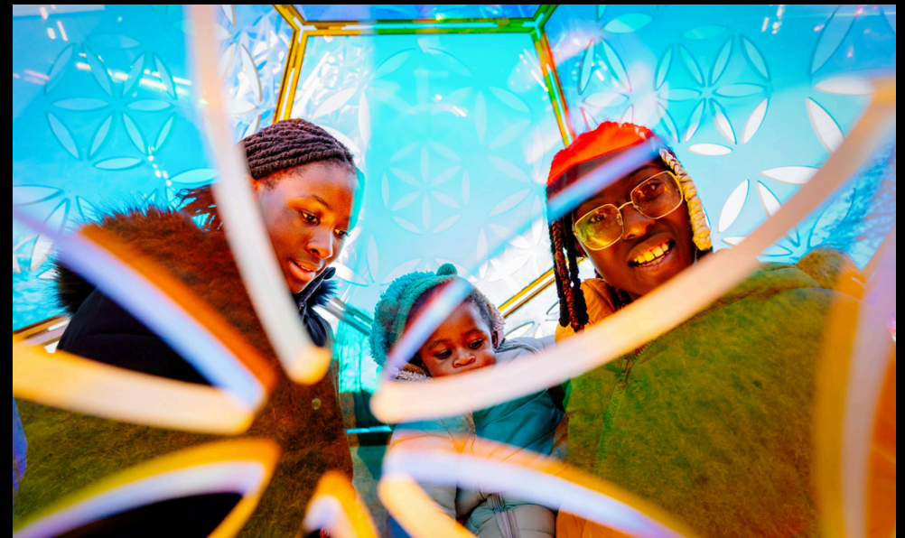
A Magical Middleport Winter (2024).

The programme empowers local residents by involving them in decision-making and creating opportunities for volunteering. It also works to build long-term relationships with arts partners, supporting local artists and organisations while fostering social and economic benefits for the area. Appetite’s innovative approach and community focus have made it a key contributor to the cultural and social vitality of Stoke-on-Trent and Newcastle-under-Lyme.