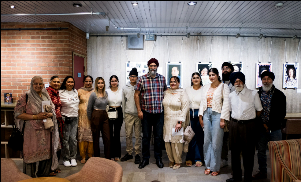
Appetite & New Vic Theatre - Punjab to the Potteries (2023)